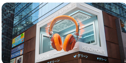
Outdoor Glasses-Free 3D