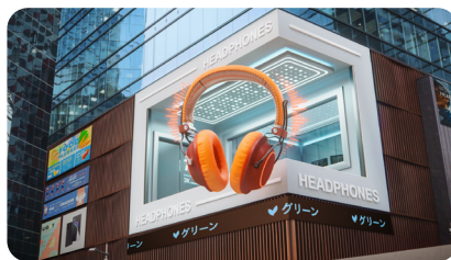
Outdoor Glasses-Free 3D